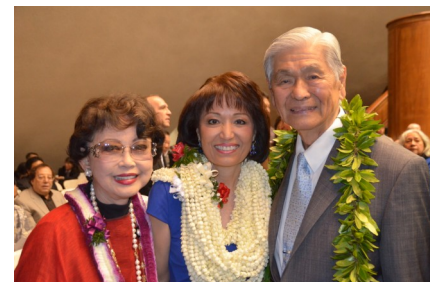
Former Gov. Ari- yoshi and wife Jean