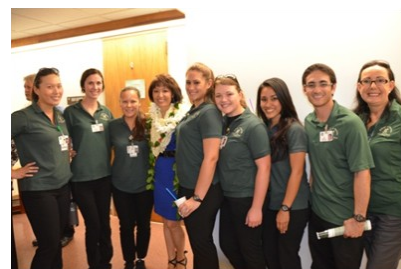
UH Manoa Nursing Students